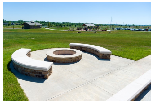
WEST PAVILION - FIREPIT